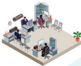
Corporate Spaces Executive Offices & Banks