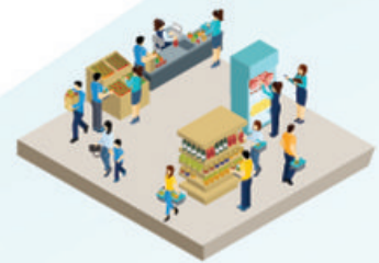
Shopping Experience Branded Shops