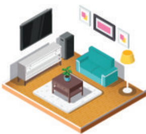
Smart Living Apartments

The total size of the project is approx. 85,000 sq.ft, spread on 3 floors. Represent the following brands from Europe in Pakistan including Teka, Kuppersbush, Bartscher, Viessmann, Gala Ceramics, Sagi, Hacker and rather than just putting the products on racks for display we are creating a live showroom where everybody can see and experience all of these products in action, from architects and contractors to the general public. The mall will also house a Café, Restaurant and a full Food Court catering to all different tastes and flavors.